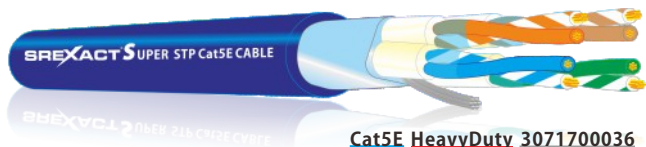
Cat5E HeavyDuty 3071700036