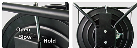
Two Steps Brake