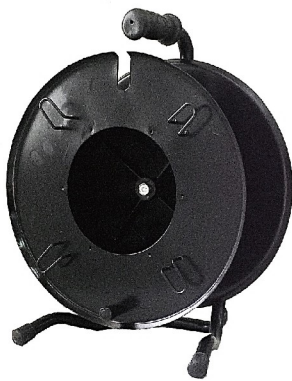
SDC-RH380-U4 Metal Material Panel with Cable Hook With Hand Carry