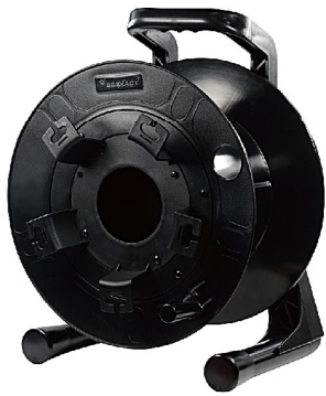
SDCP-RH380-U5 Plastic Material Cable Hook can be Replaced with Panel