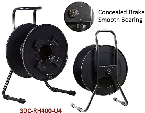
SDC-RH400-U4 Metal Material Panel with Cable Hook With Hand Carry