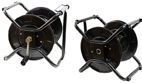
SDC-R240 Metal Material With Crash Proof Ring With Detachable Handle