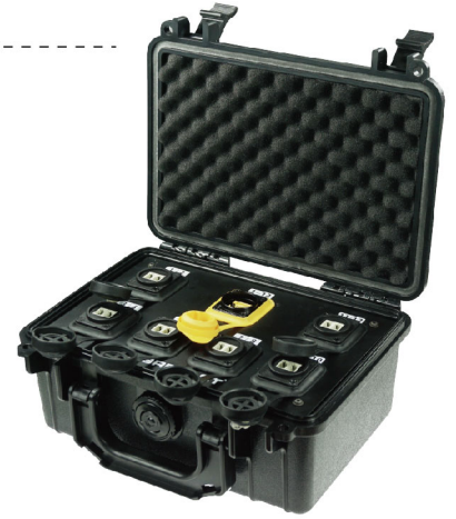
SVP600 Adaptor Box