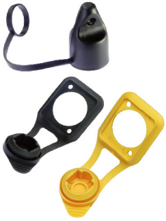
MPO Plug Protective Cover