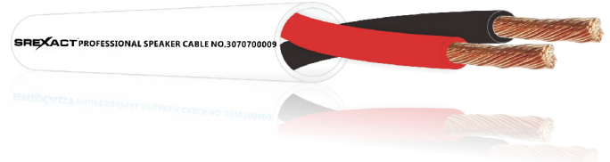
Shield Twisted Pair Speaker Cable for Installation 固定安裝用有屏蔽對絞型喇叭線