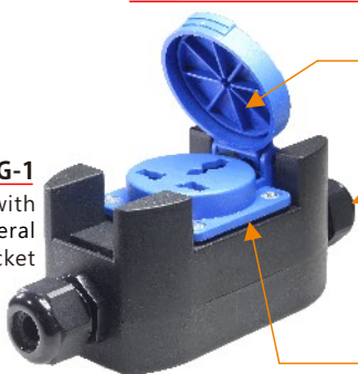
3P-10WG-1 box with World General socket

The connector is a standard product with V0 flame retardant rating