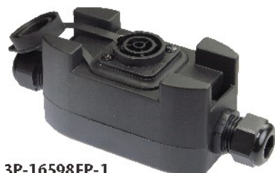
3P-16598FP-1 Box with SVP598F-P socket