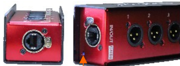
設計有接地開關 With GND switch