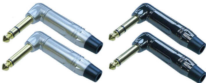
TRS SP101-CPA-R-S-PG TS SP102-CPA-R-S-PG