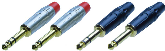
TRS SP101-CPA-PG-RD TS SP102-CPA-PG-RD