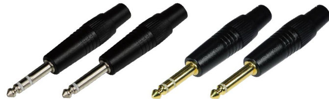
TRS SP101-CP2-PA-BK TS SP102-CP2-PA-BK