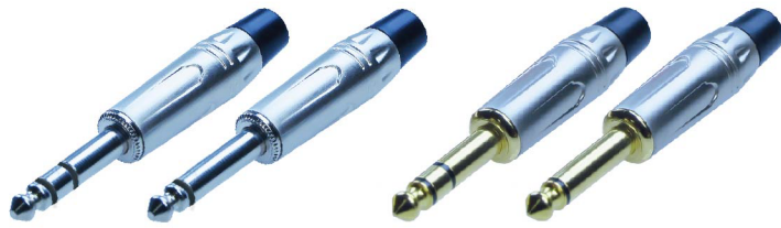
TRS SP101-CPA TS SP102-CPA