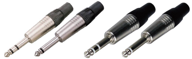
TRS SP101-CP2 TS SP102-CP2